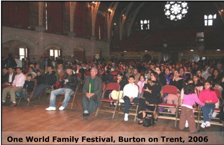
One World Family Festival, Burton on Trent, 2006

I t is time for people of all faiths to put aside reluctance to hold dialogue. It is time to recognise our common concerns, to unite and speak out about the current wrongs and evils happening in Creation. Together we have the opportunity to show these concerns and to speak with a united voice.